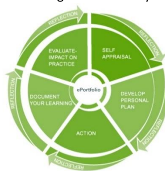
The five stage CPD cycle for pharmacists registered in Ireland

Recording your CPD systematically means that you have recorded it in a structured way following the five stage CPD cycle. You should reflect and record at each stage of the CPD cycle.